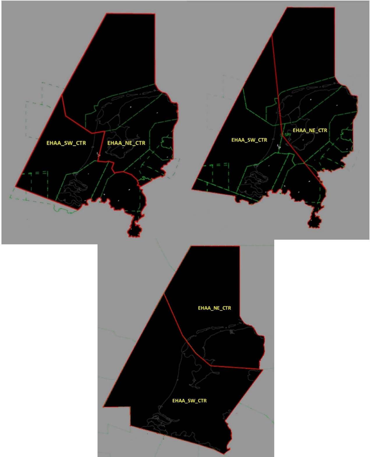
Figure 1. Area of responsibility secondary sectorisation level Amsterdam ACC

The AOR of EHAA_NE_CTR and EHAA_SW_CTR are indicated in figure 1. Note that the lateral airspace boundaries are different below FL195 (left), between FL195-FL245 (right) and above FL245 (below).